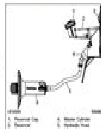
Fig. 5 Clutch Hydraulic Fluid Level Checking

If the fluid level is below the MIN line, fill the reservoir with DOT 3 brake fluid until the level reaches the MAX line. See Fig. 5.