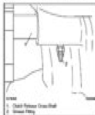
Fig. 3 Clutch Release Cross-Shaft Grease Fitting

The clutch release cross-shaft is equipped with two grease fittings in the transmission clutch housing. See Fig. 3 and Fig. 4. Wipe the dirt from the grease fittings and lubricate with multipurpose chassis grease.