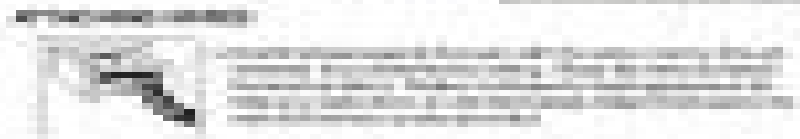
Figure 3 Diagram illustrating the structural system, showing the core and columns.