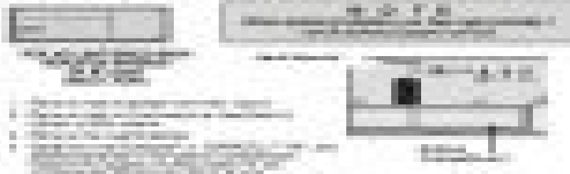
Figure 9 Diagram illustrating the structural system, showing the core and columns.

Figure 8 Diagram illustrating the structural system, showing the core and columns.