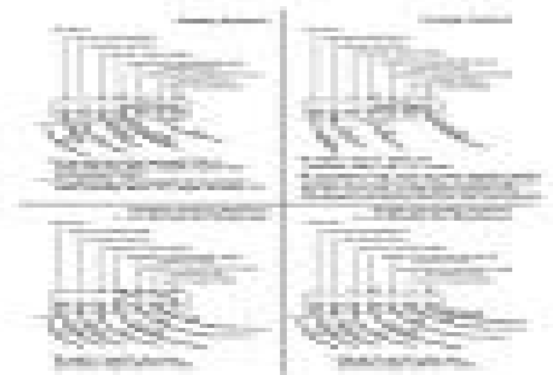
Figure 5 Diagram illustrating the structural system, showing the core and columns.