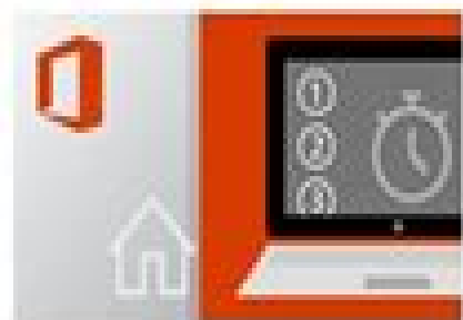
Office 365 for home