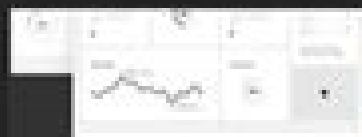
Elegant Wireframe Kit FREE

Recent Saved Mobile Web Print Film & Video Art & Illustration