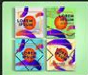
New Wave Social Media FREE