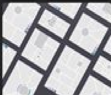
Mosaic Social Media FREE