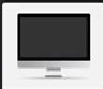
Desktop Vector Mockup FREE