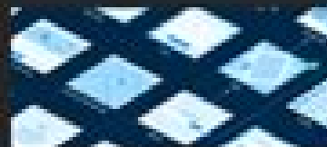
Platforma Web Flowchart FREE