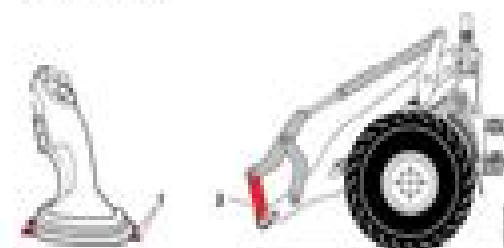
Fig. 353 Removing the transport safety retainer