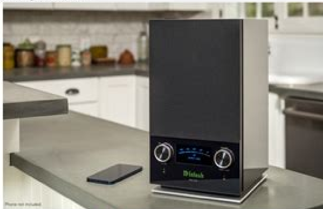
Phone not included

* Requires use of a third-party Google Assistant device with voice input built separately. The RS150 and Google Assistant device must be on the same network.