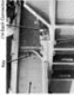
Ring and Support