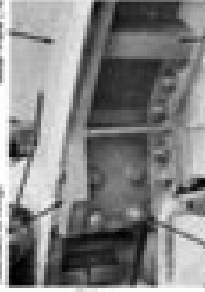
Ring and Support