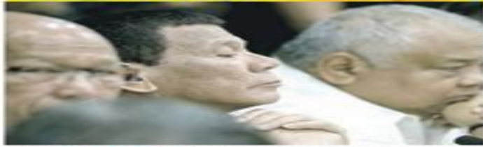
MINDING THE STORM. President Rodrigo Duterte (center) monitors the path of Typhoon Ompong (top photo) at the National Disaster Risk Reduction and Management Command Operations Center at Camp Aguinaldo on Thursday. Ompong's path to threaten the Philippines this year, has specifically affected the entire Luzon area under Signal 1, has prompted thousands to evacuate ahead of its heavy rains and fierce winds set to lash the northern Philippines before moving on to China. At right, the Taguig City disaster response center, several hours before the typhoon makes a landfall—of its own storm.