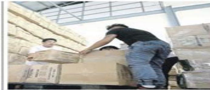
FOR REGION 1. Workers from the Department of Social Welfare and Development are seen working at a Port City warehouse Thursday. The goods intended for the Bicolandia, projected to be on the path of incoming powerful Typhoon Ompong. Next page

The global record came as output from the Organization of Petroleum Exporting Countries (OPEC) fell to 29.6 million barrels per day in August, down from 32 million barrels per day in July. Next page