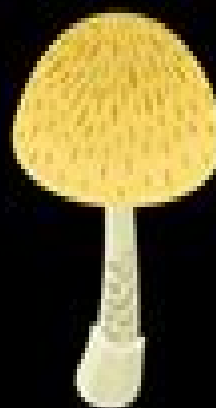
DEATH CAP non-edible