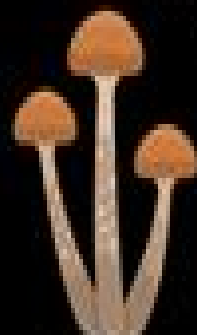
HONEY MUSHROOM edible