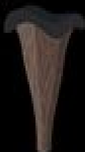
BLACK TRUMPET edible