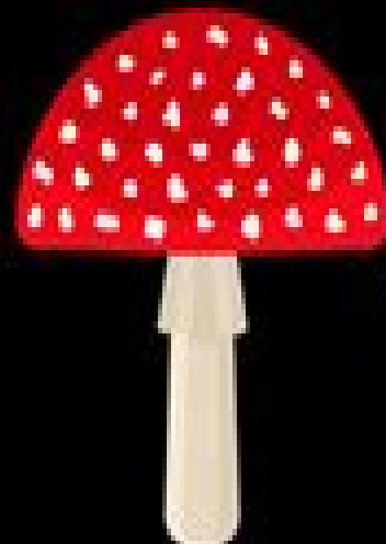
FLY AGARIC non-edible