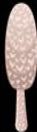
SHAGGY MANE edible