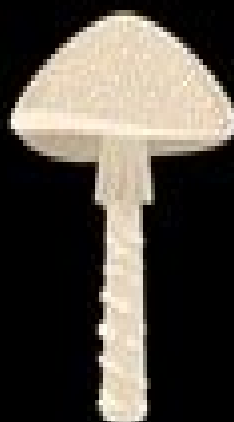
DESTROYING ANGEL non-edible