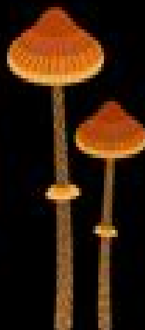
CONOCYBE FILARIS non-edible