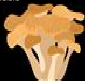
HEN OF THE WOODS edible