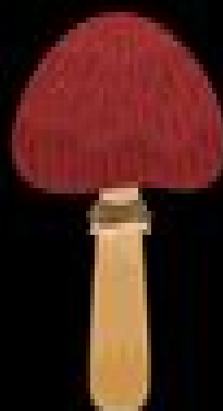
KING STROPHARIA edible