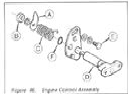
Figure 46. Engine Control Assembly