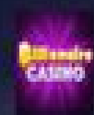
Billionaire Casino Slots 777