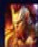
RAID: Shadow Legends