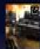
World of Tanks