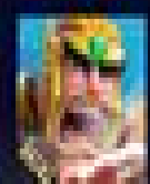
Lords Mobile: Kingdom Wars