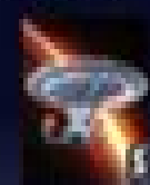
Star Trek™ Fleet Command