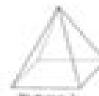
Figure 1 Surface Area is 2\sqrt{2}

19. What is the dilation scale factor of the surface area between the two 3D figures?