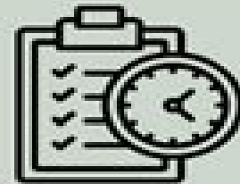
Time management test