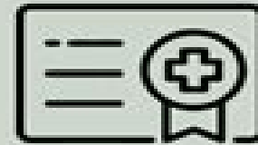
Health Care Aide test