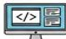
WEB DESIGN Prechdong Hustle