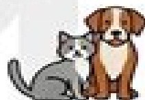
PET SITING Interoping