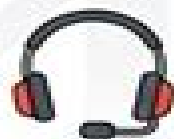
VIRTUAL ASSISTANT Content Stiotut Your bloke