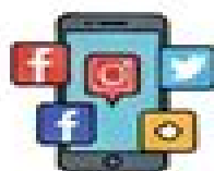
SOCIAL MEDIA MANAGEMENT