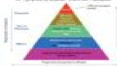
A. "Pyramid of Effects" from the Publication