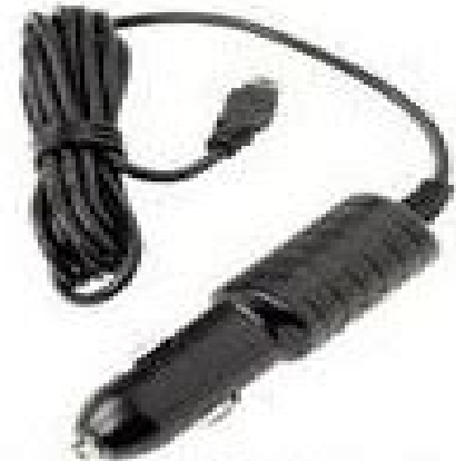
vehicle power cable