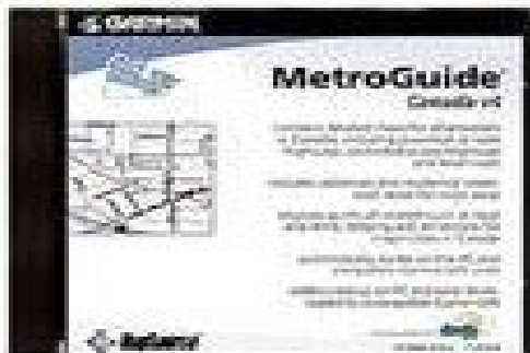
Mapsource MetroGuide Canada