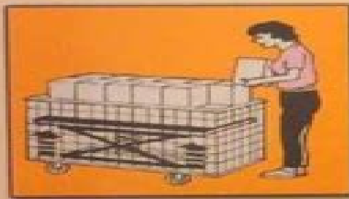
◀ SPRINGS DOLLIES ▶