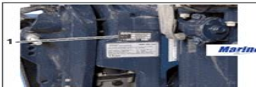
1. Model and serial number

Model and serial numbers are located on the swivel bracket and on the powerhead.