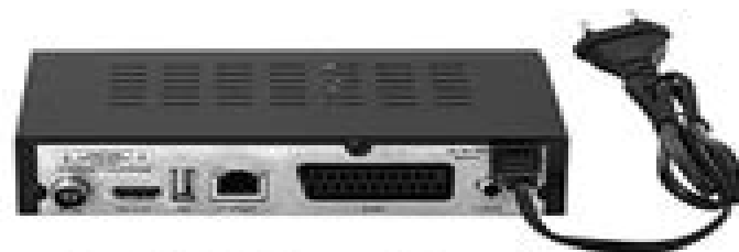
SCART set-top box