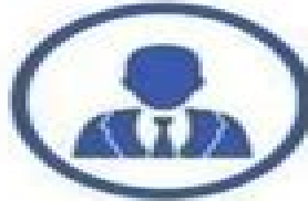
YOUR OWN BUSINESS