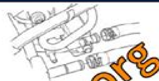
Fig. 53: Identifying Power Steering Hoses

Raise the vehicle on the hoist to full height. Connect the power steering pressure switch connector (A).