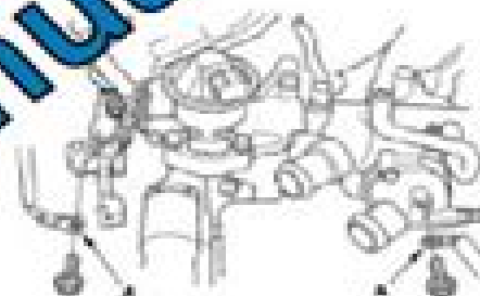
Fig. 24: Identifying Ground Cables Courtesy of AMERICAN HONDA MOTOR CO., INC.

J35A6 and J35A7 engines: Remove the ground cables (A).