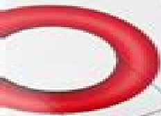
Illustration 1.1. O-ring Pre-Installation To calculate the seal, determine the seal, determine the multiply by the squeeze req. the recom. to a mult. The o- of pr pre the d

To create seal space, the gland depth must be less than the seal cross section.