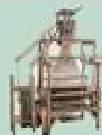
Jacquard Loom (1804)