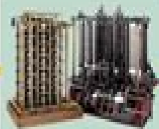
Analytical Engine (1833)