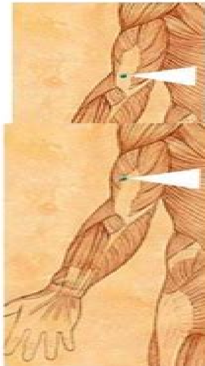
Punto 12 (TB-

Situado en la cara punto se través del biceps.