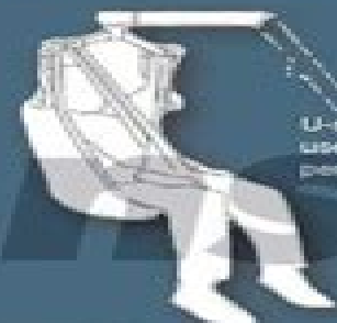
U-sling being used by a person