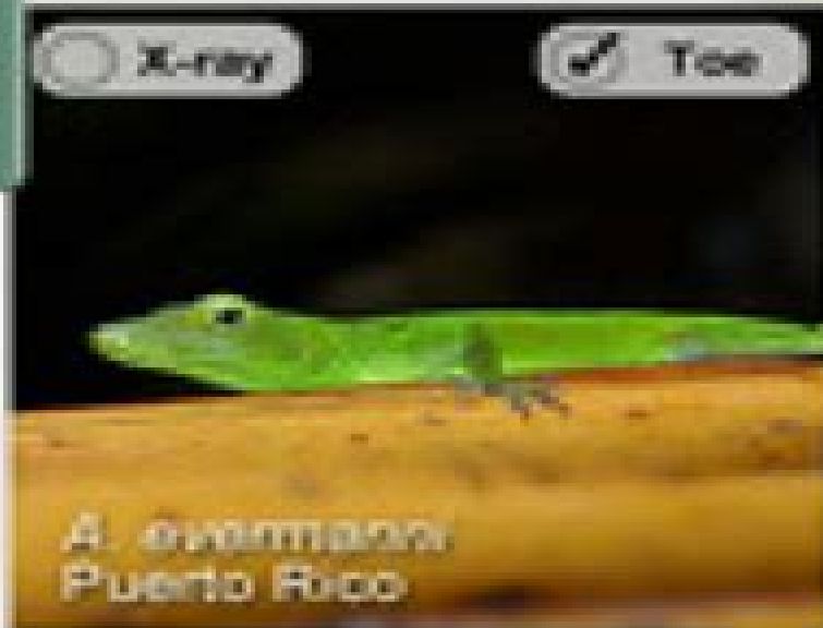
A. evermanni Puerto Rico