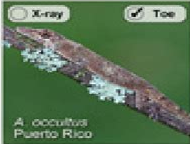
A. occultus Puerto Rico