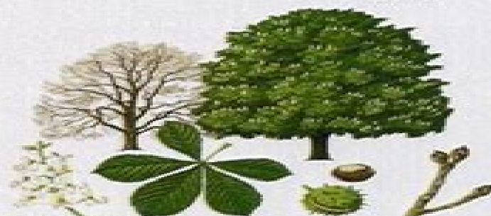
HORSE CHESTNUT Aesculus hippocastanum