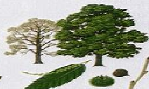
SWEET CHESTNUT Castanea sativa