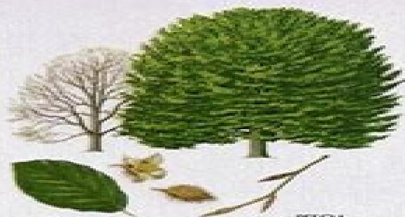
BEECH Fagus sylvatica