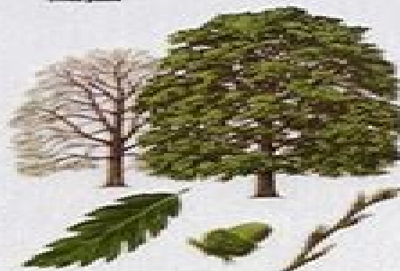
TURKEY OAK Quercus cerris