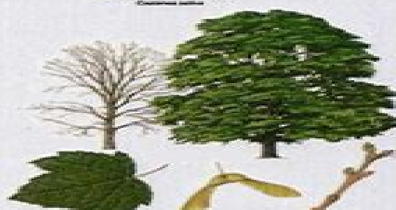
SYCAMORE Acer pseudoplatanus