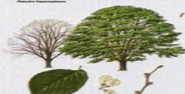
WYCH ELM Ulmus glabra