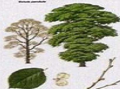
COMMON OR ENGLISH ELM Ulmus procumbens