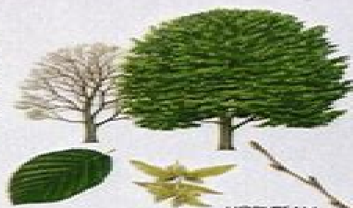
HORNBEAM Carpinus betulus