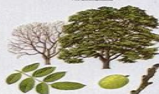
WALNUT Juglans regia