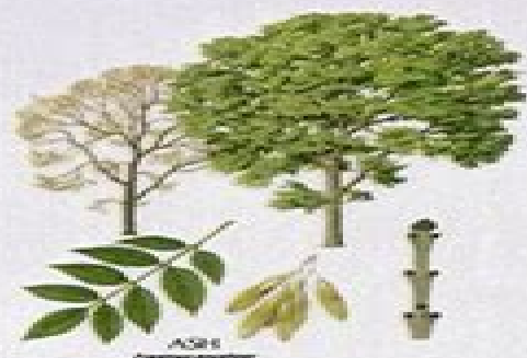
ASH Fraxinus excelsior