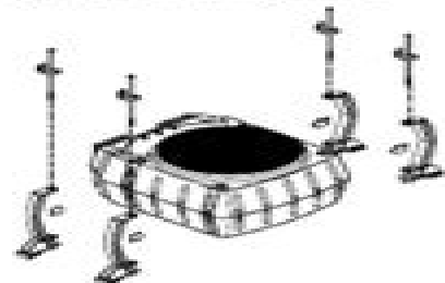
Figure 2. Horizontal mounting of BassLink.

Horizontal Mounting: Slide the four horizontal mounting feet over the sides of BassLink until they snap into the indentations molded into the sides and bottom of BassLink. The three side-mounted knurled knobs (controls) should be facing up to allow adjustment after the unit is mounted. Insert the bolt provided through the hole opposite the mounting feet and tighten it with a screwdriver. Securely mount BassLink to the mounting surface with tapping screws. You will use four bolts to mount BassLink horizontally.