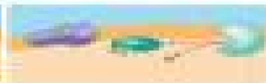
Figure 1 (d)

4. Explain the mechanism of action of the protein Figure 1 (d) in the signal transduction pathway. (10 points)