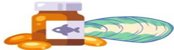
FISH OIL & GREEN-LIPPED MUSSELS