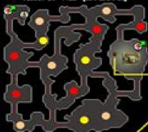
Vault of War (1st Level)