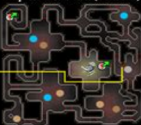
Sepulchre of Death (4th Level)

Open for: - Unlock "Idea" emote - Receive 5,000 coins