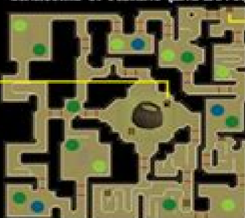
Catacomb of Famine (2nd Level)

Open for: - Unlock "Flag" emote - Receive 2,000 coins