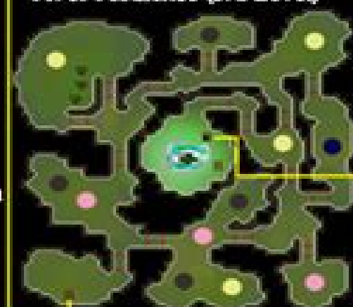
Pit of Pestilence (3rd Level)

Rope Takes you back to the starting point of the Level