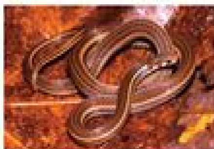
Fig. 109: Masticophis lateralis , Tapero N°1, Carapaz. R.W. Van Der Kraak