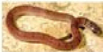
Fig. 109: Naja naja, San José, San José