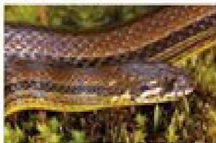
Fig. 109: Masticophis lateralis , male, Jaramango, Panama. S. Latorre