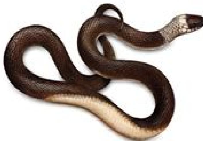
Fig. 112: Naja naja