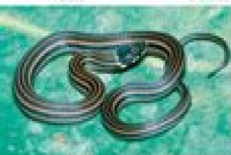
Fig. 109: Masticophis lateralis , Montecito, Panama. R.W. Van Der Kraak