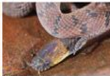
Fig. 109: Naja naja, Santa Clara, Panama.