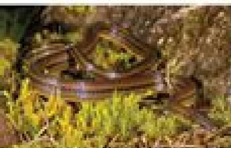
Fig. 109: Masticophis lateralis , male, Jaramango, Panama. S. Latorre