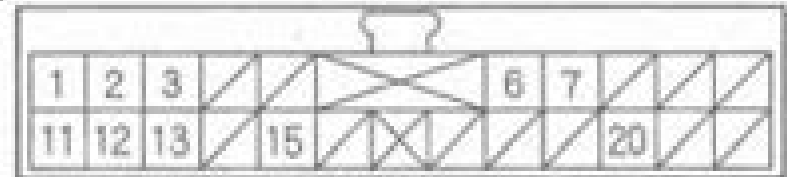
CONNECTOR B (22P)