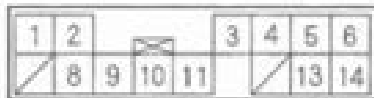
CONNECTOR E (14P)