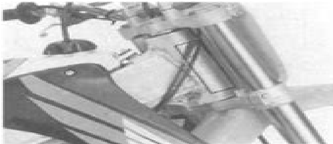
(1) The frame serial number is stamped on the right side of the steering head.