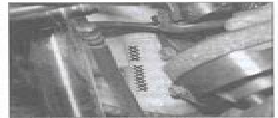
The frame number is stamped on the right-hand side of the steering head