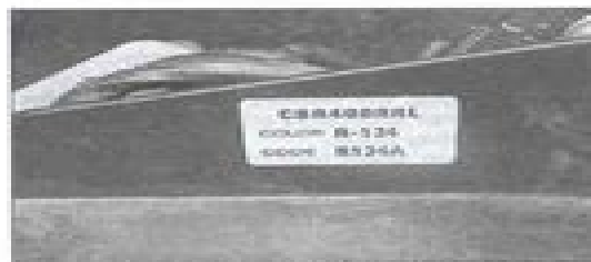
The colour code label is under the passenger seat