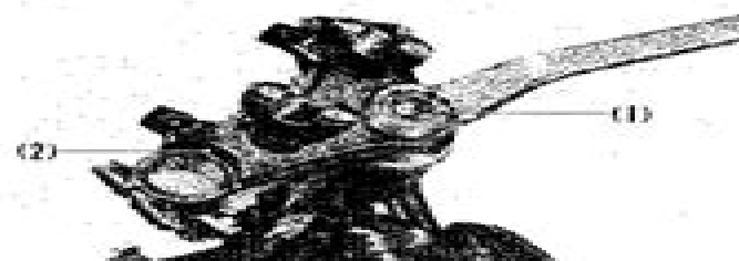
Fig. 5-65 (1) Steering stem nut (2) Fork top bridge