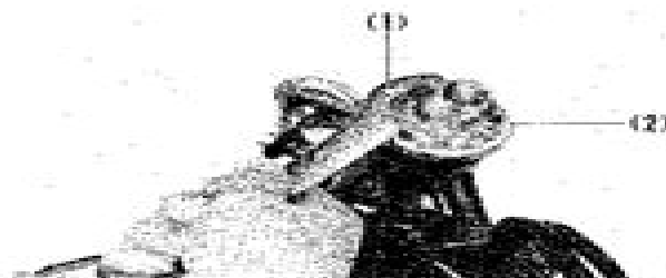
Fig. 5-66 (1) 46 mm pin spanner (2) Steering head top thread