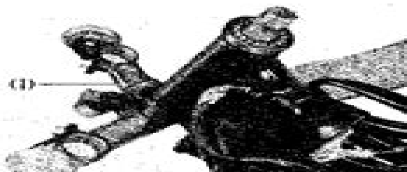
Fig. 5-68 (1) Stop