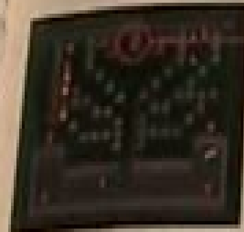
Meaning: The Map